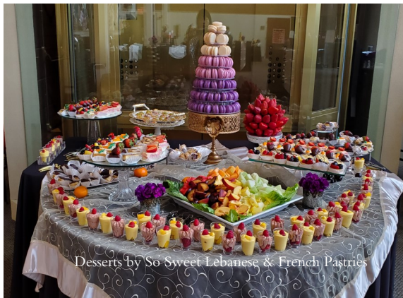
Desserts by So Sweet Lebanese & French Pastries