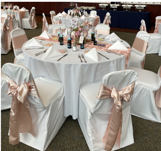
Linens by I Do Chair Covers