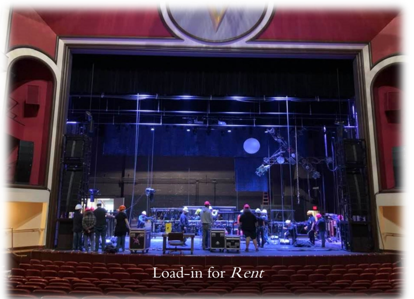
Load-in for Rent

A round of applause for our generous sponsors!