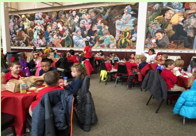
Students enjoying lunch in the Grand Lobby after watching a performance of Junie B. Jones .

Valentine School Days shows: The Very Hungry Caterpillar ; Twelfth Night ; Biscuit ; Sleeping Beauty ; Amber Brown is NOT a Crayon ; Harriet Tubman and the Underground Railroad ; A Sick Day for Amos McGee ; and Ballet Theatre of Toledo's The Ugly Duckling .