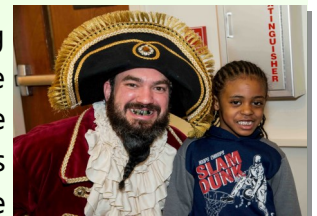
How I Became a Pirate!

We love introducing youngsters to the thrill of live theatre. And, thanks to the generosity of local funders like Buckeye Broadband, the Stranahan Foundation, the LaValley Foundation, and others, thousands of students are able to attend VSD every year for free. Nothing beats watching students walk through our theatre after a show and exclaim "How cool was that!"