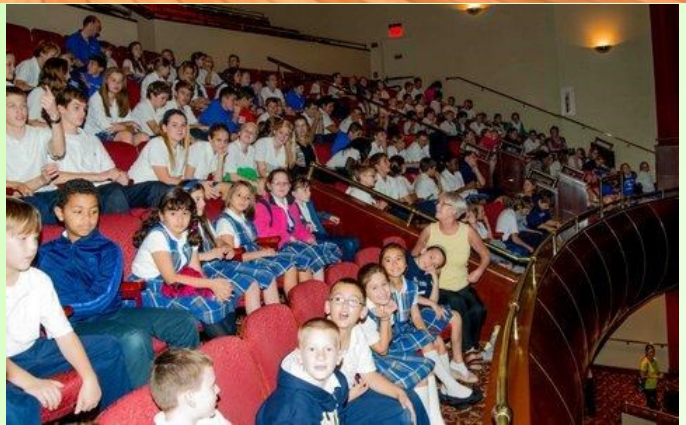
Students from Toledo Public Schools enjoying a Valentine School Days performance

For our 2018-2019 season, we will present 8