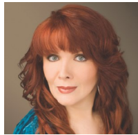
McGovern Apr. 21

Save the date Friday, April 21, for a Valentine Solo Premiere with Oscar-winning vocalist Maureen McGovern. Celebrated as "The Stradivarius Voice," expect an evening of hits from the '70s, '80s, '90s, and today, including "The Morning After."