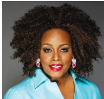
Reeves Feb. 28

The Valentine's incomparable Velvet Vocal Series is a musical high note of our season. As we go to press, we look forward to welcoming back the glorious Dianne Reeves for an intimate evening of bossa nova classics, jazz solos, and beautiful ballads. The five-time Grammy Award-winner is currently on national tour.